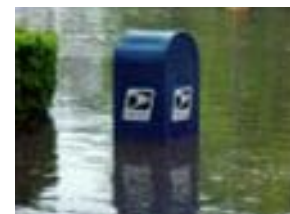
The Great Flood