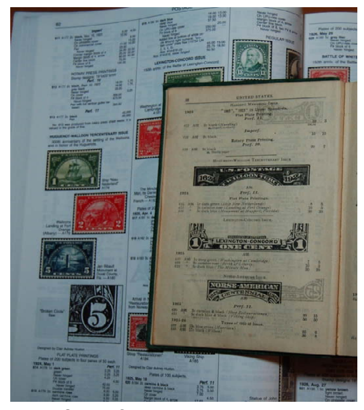
Scott's Catalogue 1933 and 2008

Treasures' Report: Checking -- $886.24; Savings Account -- $1,505.33; Total -- $2,391.57