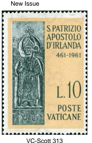
In general, this last two months, we've been looking at Topical Stamp Collecting or collections that consist of stamps which are chosen for their designs, rather than for the countries that issued them or the class of postal service they provide.

Topical collecting provides an inexpensive way to collect stamps and has been proven as a way to get youngsters interested in the hobby (and for old philatelist, something to do as national collections become expensive to maintain). The beauty of the collection is it allows the individual to collect purely for our own pleasure, classify the material as he wants and not worry about format — no two topical collections can ever be the same. .