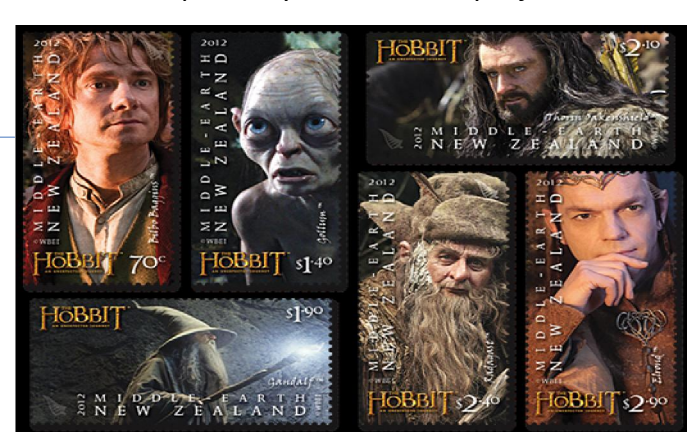
This month's topic is to be announced.

It appears that in New Zealand that Hobbits stamps are the rage and even a newly freed felon can use the postal system to line up a job.