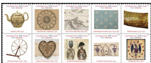
23 May (Booklet)

Note: A pane of 25 "Encore" stamps Design has not been released